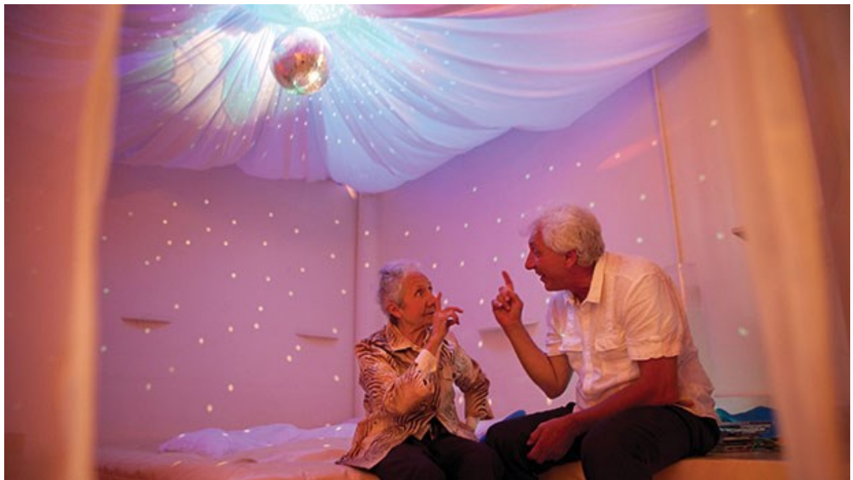
Figure 3 Snoezelen example [13]