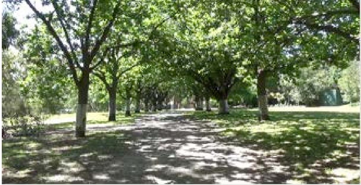
Figure 1 An outdoor environment within a city

This is a very simplified, meta-version of a natural environment, but it serves as a starting point for the development of the Sound, Shadow and Light system.