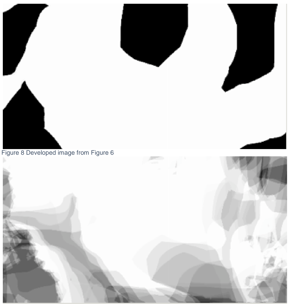
Figure 9 Alternate developed image from Figure 6

When developing the sound aspects of the system, the approach taken is to reflect the sounds that may best coincide with the environment being represented. Figure 10 shows an amplitude graph, in yellow and showing higher amplitudes as spikes, and a melodic graph, in blue and red showing a spectral frequencies, with the red frequencies being louder than the blue frequencies. This provides 15 seconds of sound recorded with the images shown in the previous figures. These graphs are overlaid to show amplitude and spectral information. This kind of information will be used to ensure a firm relationship exists between the sound and vision.