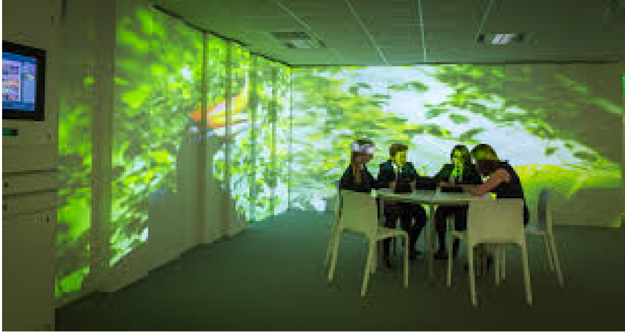
Figure 4 Immersive environment example [14]