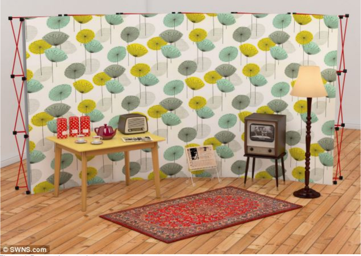
Figure 2 Rempod example