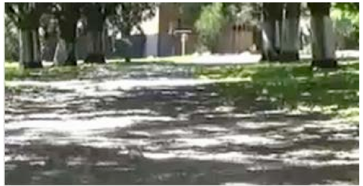
Figure 6 Enhanced image from Figure 4